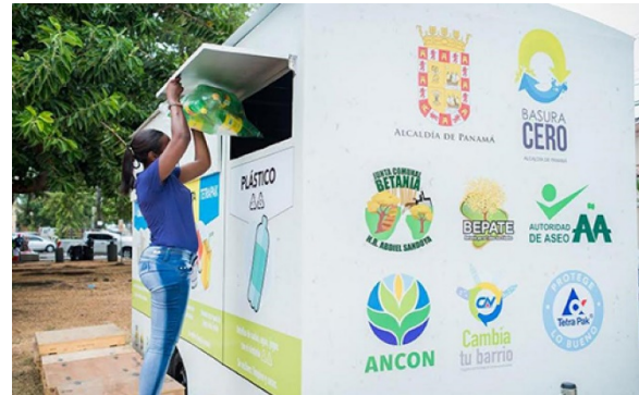
Illustration 3 Collection point Basura Cero

No Waste (Política No Basura). 11 This law tries to promote and develop a culture of no waste, however, implementation