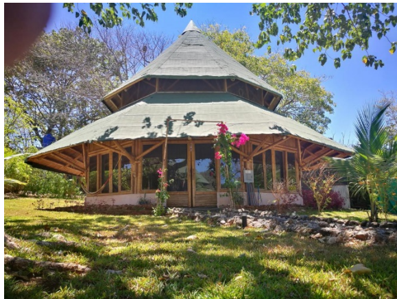
Illustration 5 Eco-lodges in Panama: potential for CE applications

shown that decarbonization 14 can be applied to sectors such as the agricultural and logistical sector.