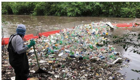
Illustration 2 Marea Verde cleaning a river

recollection points in Panama-City. 7 'Marea Verde' is a non-profit association looking to create awareness about the contamination of rivers and coasts in Panama. They develop initiatives to clean rivers (see illustration 2), while also implementing awareness campaigns. 8 All in all, in the private sector there is enthusiasm towards sustainable solutions such as circular economy, as well as more resources to work with. Currently, circular economy is still in the beginning phase, and time and effort is needed to familiarize sectors with circular economy. However, the institutional framework, and more importantly the legal framework are inherently at the basis of progress in this regard.